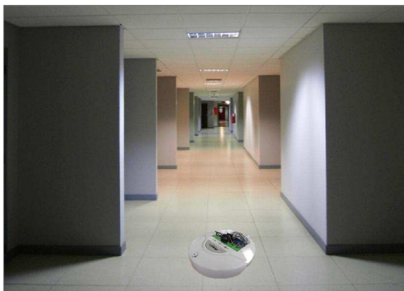
Figure 2. Virtual rendering of the robot at Politecnico di Torino

We have developed a proof of concept of the complete navigation method using the iRobot Create [12] and the Matlab environment [14]. iRobot Create (see Fig.2) is the research-orientated version of the more popular iRobot Roomba: it has the same robotic base of it, but it is not equipped with the cleaning system. It is possible to control it with a PC using a serial communication and the Create Toolbox Interface that allows to use a Matlab real-time script to control it. There is a Simulator to test the algorithms. On the hardware side, it is equipped with different sensors (bumpers, encoders) and through the PC it is possible to connect additional external devices (as cameras).