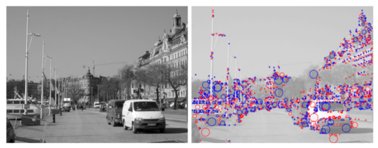
Figure 1: Scale-invariant interest points detected from a grey-level image using scale-space extrema of the Laplacian. The radii of the circles illustrate the selected detection scales of the interest points. Red circles indicate bright image features with \nabla^2 L < 0 , whereas blue circles indicate dark image features with \nabla^2 L > 0 .

A Gaussian pyramid is constructed from the input image by repeated smoothing and subsampling, and a difference-of-Gaussians pyramid is computed from the differences between the adjacent levels in the Gaussian pyramid. Then, interest points are obtained from the points at which the difference-of-Gaussians values assume extrema with respect to both the spatial coordinates in the image domain and the scale level in the pyramid.