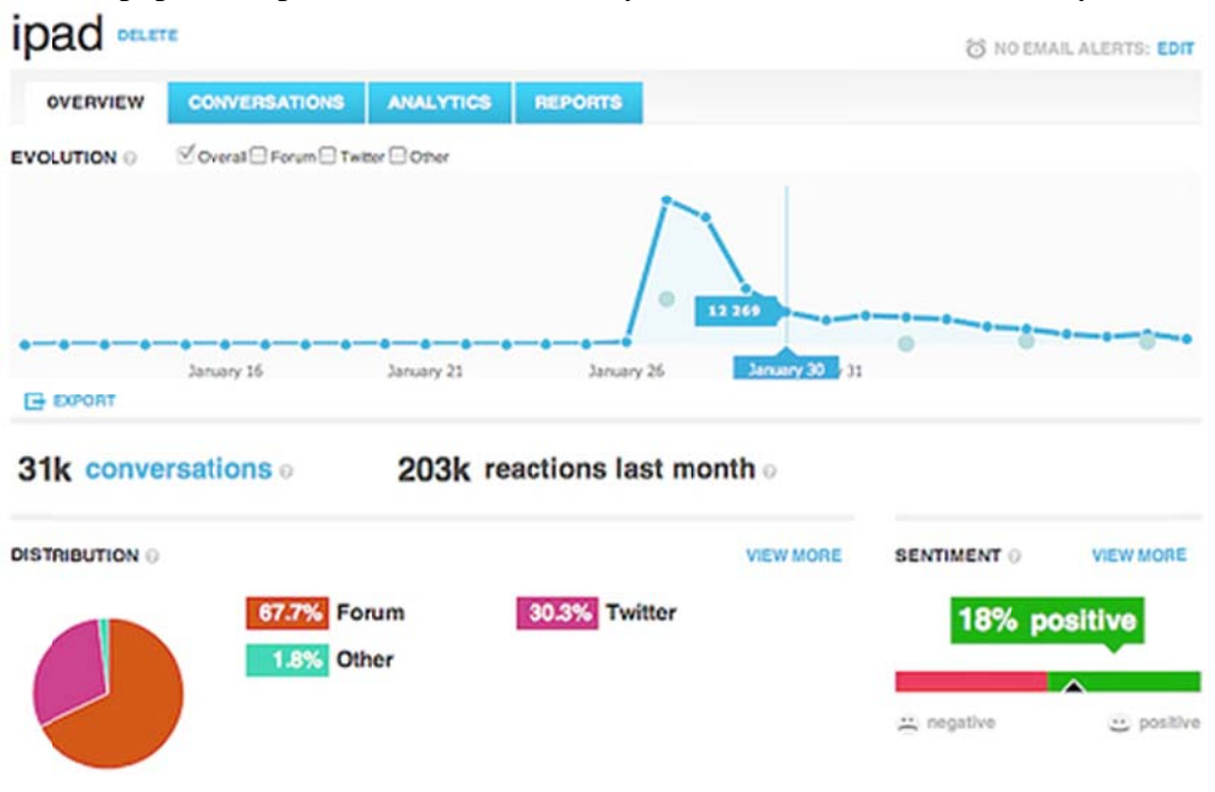
Figure 8: View of the UberVU Dashboard§§

One of UberVU's characteristics is that it not only provides the user with relevant data, but it is also presented in a very appealing way through different graphs and charts. This makes it more user-friendly than Alterian SM2 Freemium (Webbiquity 2010). The resulting functionality is a clear example on this. After you have entered the search string it crawls through all the different social media and return two main charts (see Figure ). The first one is a timeline showing when your brand was discussed about most. The second is a pie chart showing the distribution of on which social media your brand was discussed. Below these charts a list is given with the popular most posts related vour search term. (Berry