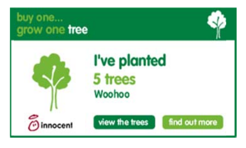
Figure 2: Innocent drinks' widget†

Widgets can be used to solicit donations. For example, Innocent drinks suggest its supporters buy a virtual badge that "automatically updates to show how many trees you have personally donated" (Innocentdrinks 2011). This widget is shown in 2.