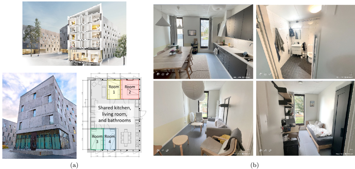
Figure 2. (a): Illustration of KTH Live-In Lab used in this experimental campaign. The majority of the living area is covered by shared spaces, i.e., kitchen, living room and bathrooms; private spaces for the testbed occupants are limited to the bedrooms. (b): Indoor view of the KTH Live-In Lab.

type of heating (e.g., electricity heating), the size of the dwelling, and the number of occupants in the apartments.