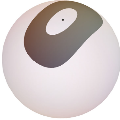
Fig. 3. Illustration of a spectral droplet (shaded) in the Riemann sphere with two off-spectral components of the complement. The point w_0 is indicated by the dot near the north pole, and the connectivity component of the off-spectral set containing w_0 is denoted by \Omega_{w_0}

Definition 1.6.1. A real-valued potential Q is said to be (\tau, w_0) -admissible if the following conditions hold: