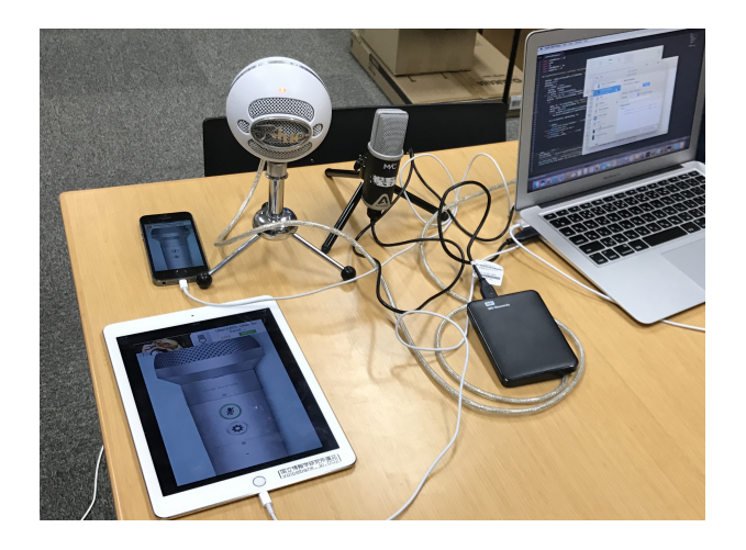
Fig. 1 . Setup for device-recording in office. The clean studio recordings were played through loudspeaker and recorded on either iPad, iPhone 5S, Mac Book Air, Blue Snowball, or Apogee Mic microphones. This setup captured noise and reverberation of room as well as limitations of recording hardware.

ity of enhanced speech. The key of the proposed method is to use directed references for training SEGAN at the initial training epochs. By using this directed reference for training the generator model, we can achieve better weight initialization; thus, we were able to robustly and quickly train the generator model. We also found that this method significantly reduces the appearance of annoying artifacts called "musical noise", something that conventional-speechenhancement methods are commonly affected by. The performance of the proposed method was evaluated through objective and subjective experiments.